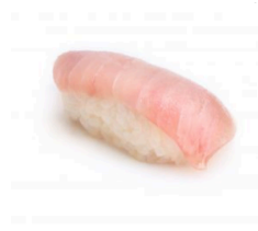
NIGIRI Pesce Bianco 2 Pz.