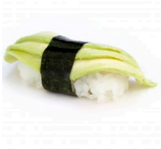
NIGIRI Avocado 2 Pz.