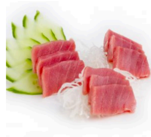
SASHIMI Tonno 9 Filetti