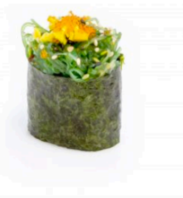
GUNKAN Wakame Goma 2 Pz.