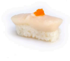
NIGIRI Capesante 2 Pz.