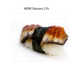
NIGIRI Unagi Anguilla 2 Pz.