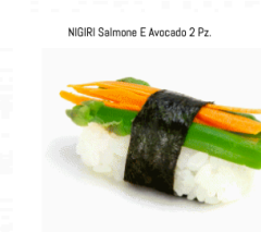
NIGIRI Vegetariano Asparago E Carota 2 Pz.