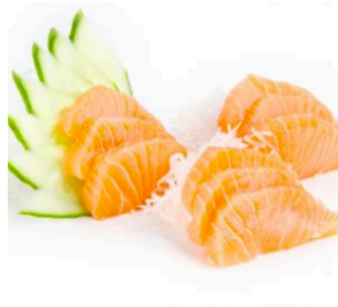
SASHIMI Salmone 9 Filetti