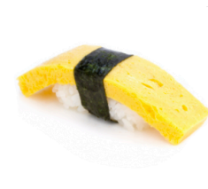
NIGIRI Tamago Frittata 2 Pz.