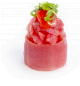
GUNKAN Tonno Spicy Tuna 2 Pz.

Gunkan Salmon marmalade and Strawberries min 2 pieces