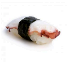
NIGIRI Polpo 2 Pz.