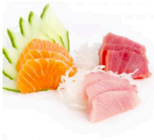
SASHIMI Misto 9 Filetti Di Pesce Assortito