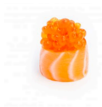
GUNKAN Ikura Salmone 2 Pz.