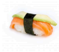
NIGIRI Salmone E Avocado 2 Pz.