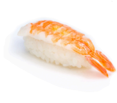
NIGIRI Gambero 2 Pz.