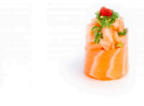
GUNKAN Tartare Salmone 2 Pz.