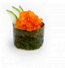
GUNKAN Ikura Classico 2 Pz.