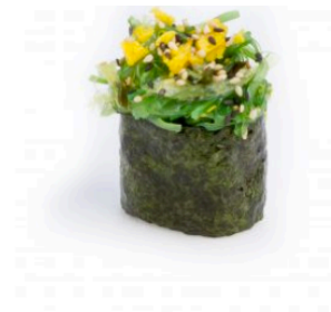
GUNKAN Wakame Goma Vegetariano 2 Pz.