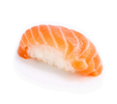
NIGIRI Salmone 2 Pz.