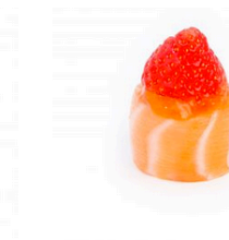
GUNKAN Salmone Marmellata E Fragola